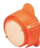
5µm Strainer 25-381 - Orange