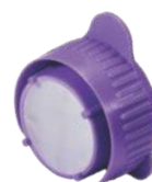
30µm Strainer 25-384 - Purple