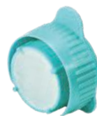
10µm Strainer 25-382 - Teal