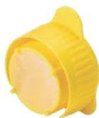
100µm Strainer 25-377 - Yellow