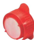
20µm Strainer 25-383 - Red