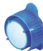
40µm Strainer 25-375 - Blue