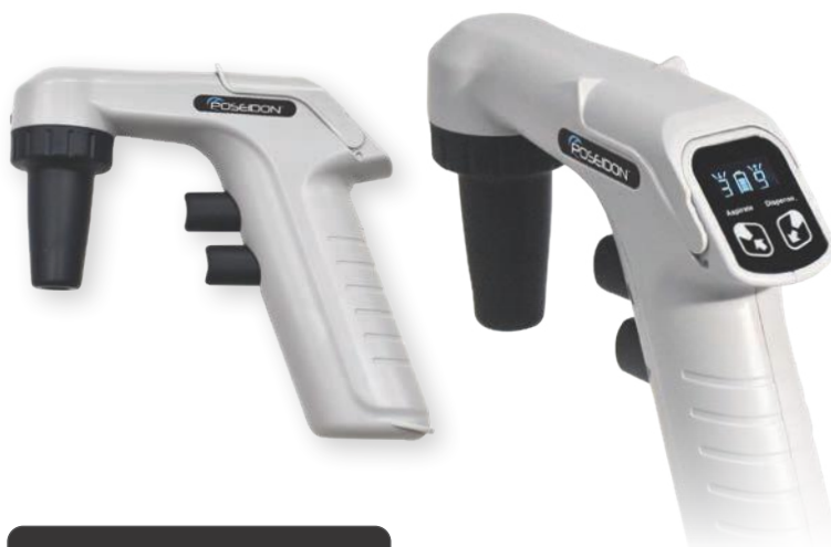
Digital Controller 33-901D