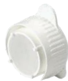
70µm Strainer 25-376 - White