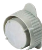
50µm Strainer 25-385 - Grey