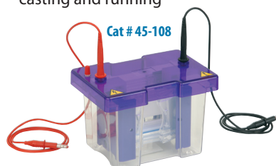
Cat # 45-108