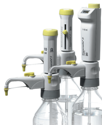
Dispensette® S Organic