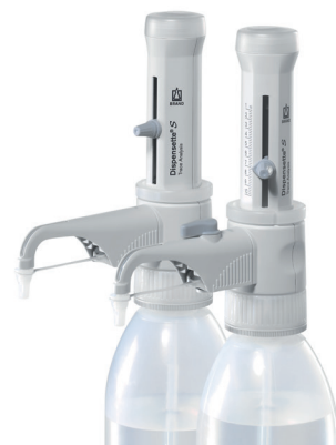
Dispensette® S Trace Analysis