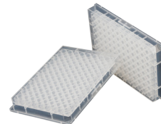
Superior Yields and Integrity Ultra-Pure DNA