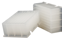
Quick Bind, Wash, Elute Workflow